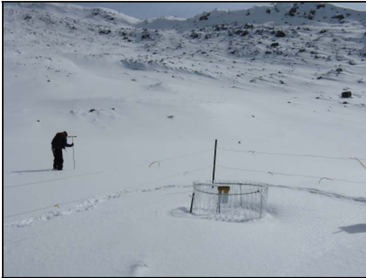
Snow-course site in the Brooks Range