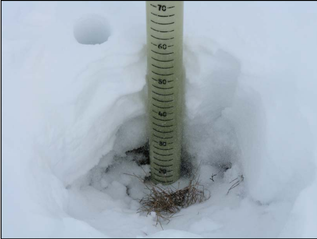
Figure 2. Adirondak snow tube inserted to snow/ground interface and snow depth recorded.